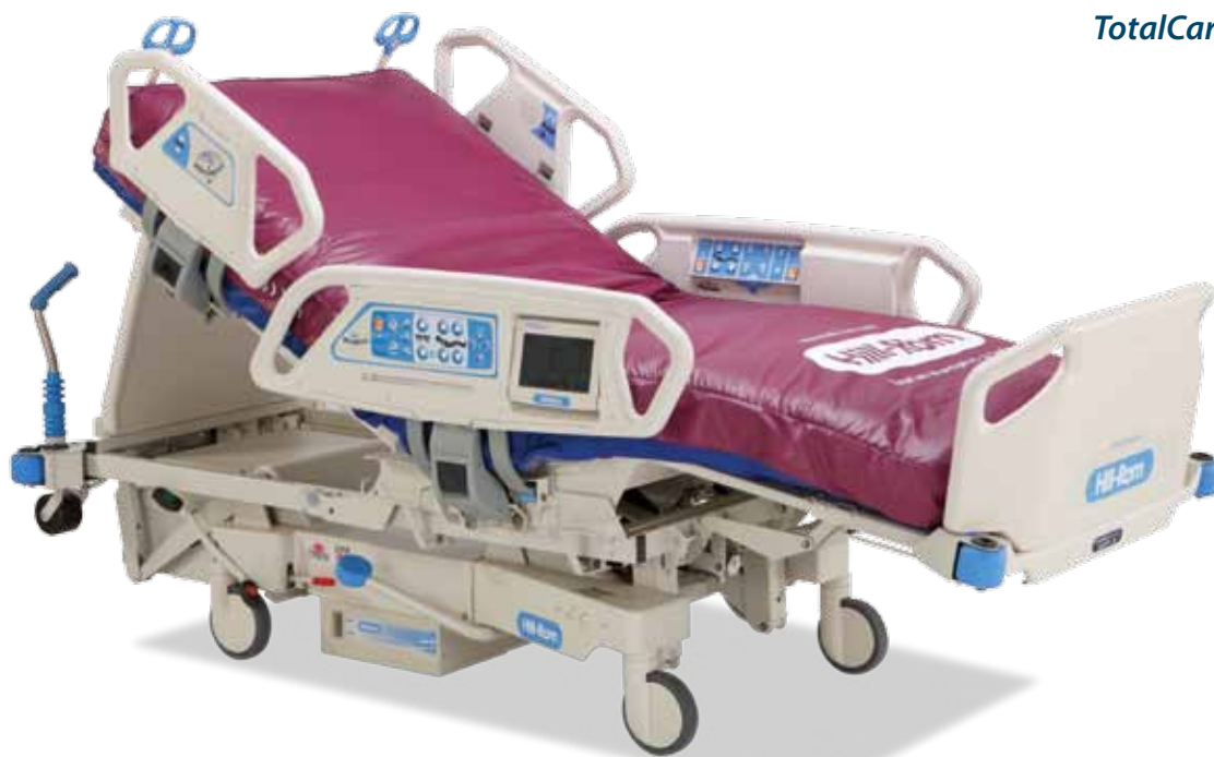
TotalCare® Bed System